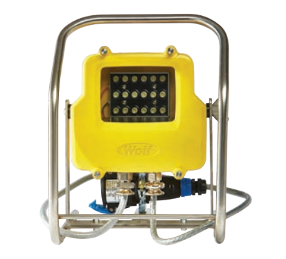
LINKEX<sup>™</sup> WF-250XL ATEX FLOODLITE